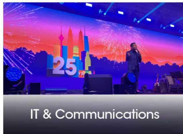
IT & Communications