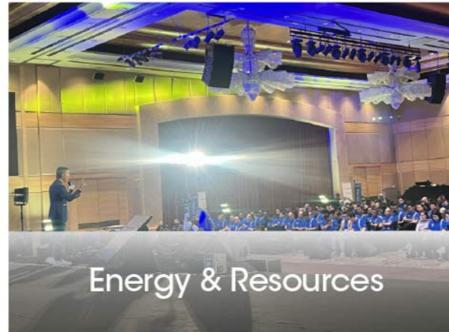
Energy & Resources