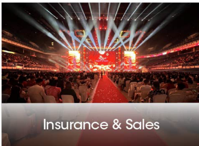
Insurance & Sales