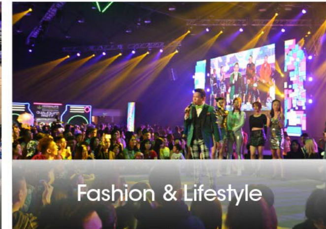
Fashion & Lifestyle