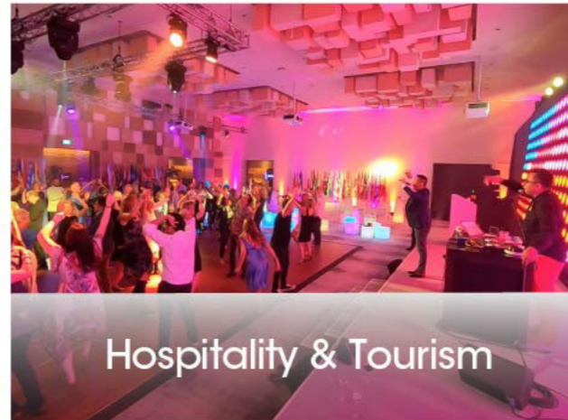
Hospitality & Tourism