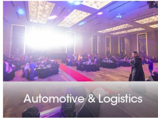
Automotive & Logistics

Go to www.MelvinAeria.com to view full list of clientele