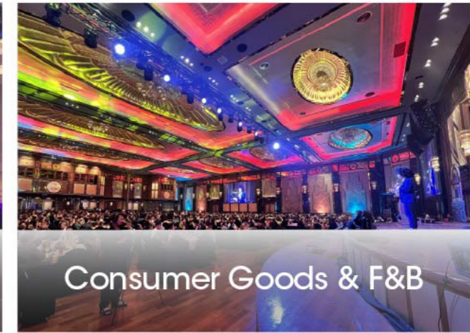
Consumer Goods & F&B