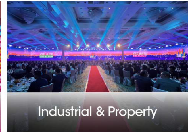
Industrial & Property