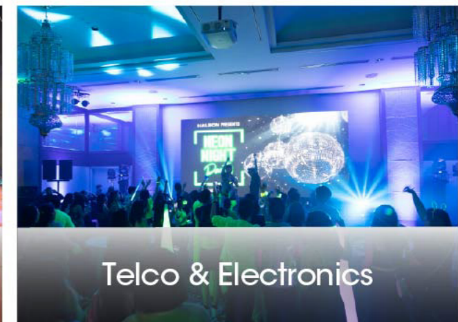
Telco & Electronics