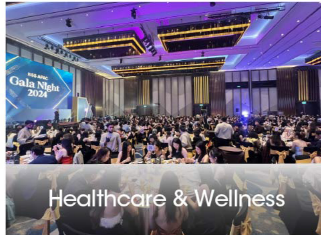
Healthcare & Wellness